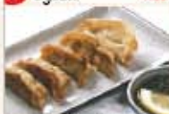
a7 Gyoza 4.50

Deep fried dumpling served w/ vinaigrette sauce