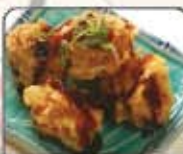
Spicy Tuna Ball

(Scallop, Mushroom & Bay Shrimp, Smelt Egg on rice w/ sauce)