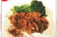
a12 Chicken Teriyaki 5.95

Grilled chicken teriyaki served w/ teriyaki sauce.