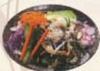
54. Salmon Skin Salad 9.95