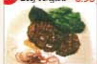
a13 Beef Teriyaki 8.95

Grilled beef teriyaki served w/ teriyaki sauce.