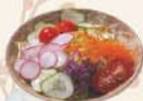
51. House Salad 3.95

Green house salad w/ cucumber, cherry tomato, radish served w/ miso dressing