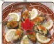
Baked Green Mussel