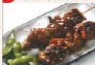
a6 Yakitori Chicken 6.50

Skewered Chicken, Vegetables w/ teriyaki sauce