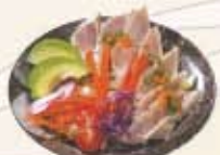
53. Albacore Tataki salad 11.50