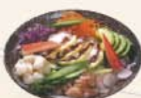
52. Seafood salad 11.95

Green house salad w/ cucumber, cherry tomato, radish served w/ miso dressing