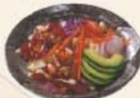
56. Spicy Tuna Salad 10.95