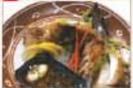
a9 Yellowtail Collar 8.95

Grilled yellowtail collar served w/ ponzu sauce.