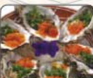
Oyster on the Shell

(8 pcs salmon on asparagus, cream cheese roll)