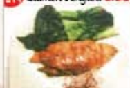
a14 Salmon Teriyaki 6.95

Grilled salmon teriyaki served w/ teriyaki sauce.