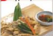
a11 Deep fried soft shell 9.95

Deep fried jumbo soft shell crab served w/ ponzu sauce.