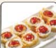
Spicy Tuna Tempura