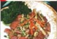
a10 Tuna Poki 13.95

Fresh tuna with cucumber, radish, sprouts, sesame oil, soy sauce