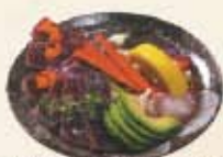
55. Tuna Tataki Salad 12.95