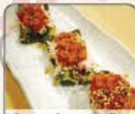
Canyon Country Roll

(Tempura flour flake on shrimp tempura, avocado roll)