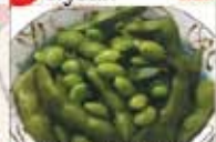
a8 Soy Bean 3.25

Deep fried dumpling served w/ vinaigrette sauce