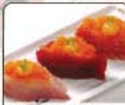
Dragon Eyes Combo

(Shrimp, avocado on spicy tuna roll w/ sauce)